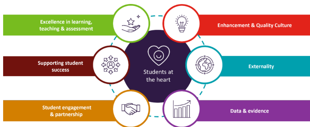
Fig 1: Principles of Scotland's Tertiary Quality Enhancement Framework (TQEF)

The SLE model was developed to underpin the TQEF principle of Student engagement and partnership , but it also plays a role in two other principles, namely 'Supporting student success' and 'Excellence in learning, teaching and assessment'.